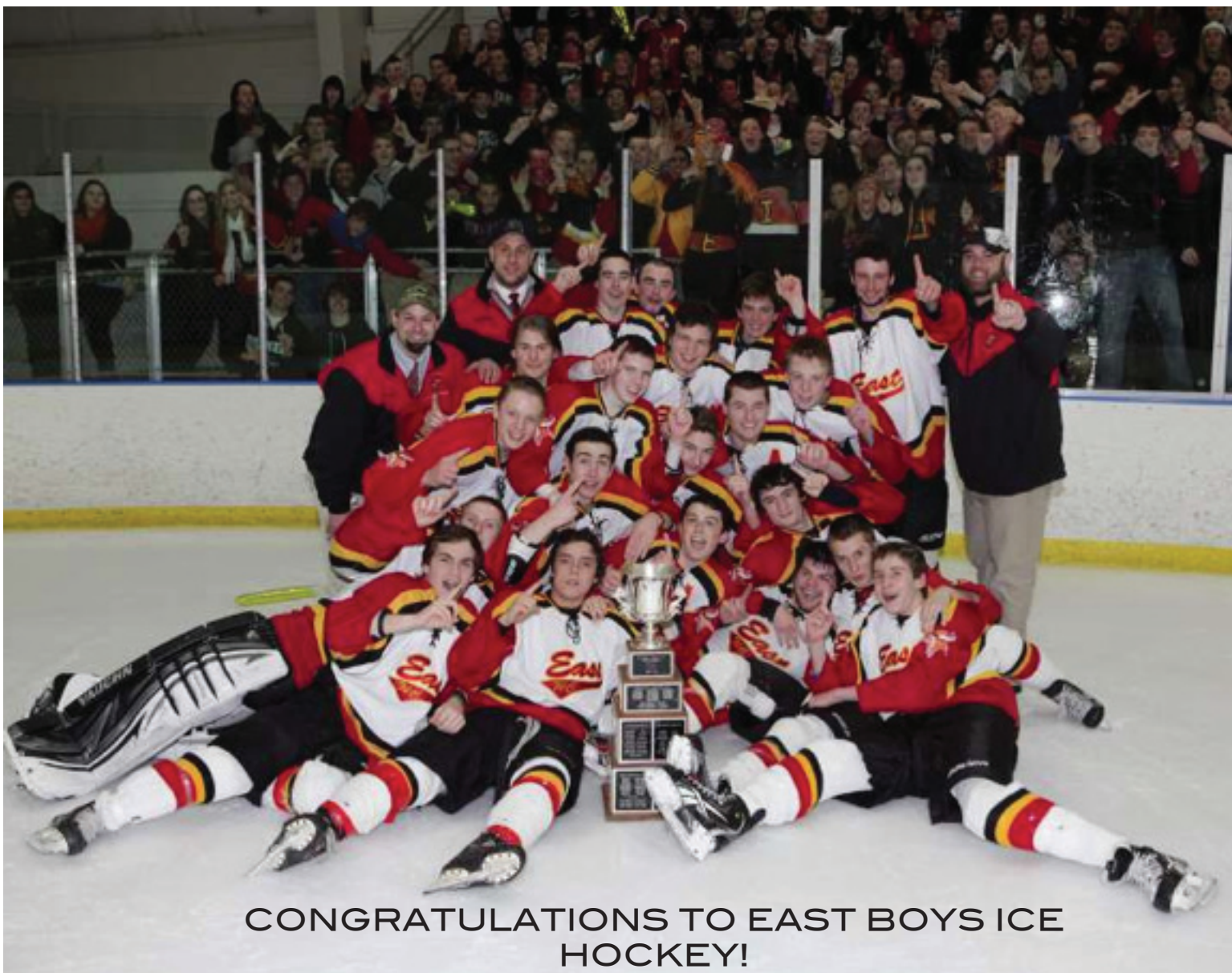
CONGRATULATIONS TO EAST BOYS ICE HOCKEY!

Track A: Most memorable meet experience was the 2011 Great Valley Relays. It rained pretty heavily all day but we competed and did not let that affect how we competed.